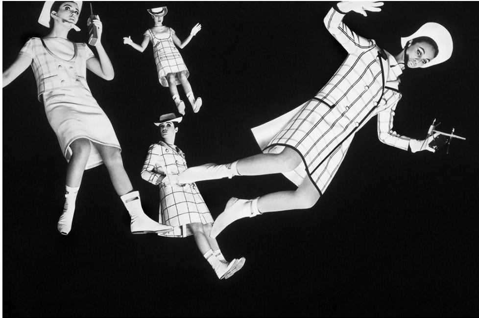
Peter Knapp, Courrèges, collection «Space Age», Paris, spring-summer 1965.

Photographer and art director Peter Knapp is one of the most globally successful Swiss fashion photographers. From 1946 to 1950 he studied graphic design at the Kunstgewerbeschule in Zurich, where he was influenced by the design principles of the Bauhaus. In 1951 and 1952 he attended the drawing class at the École des Beaux-Arts in Paris. At the start of his career he was also a painter, which led to his first solo exhibition in Paris in 1958. Peter Knapp began taking photographs early on,